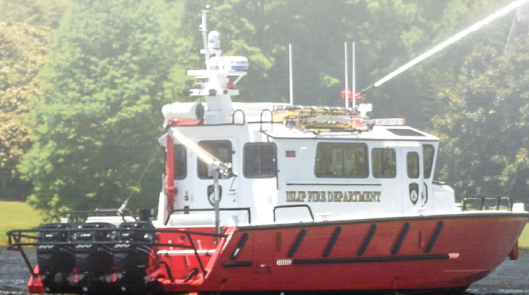
Islip Fire Department in Islip, NY

All Silver Ships boats are built to AMERICAN BOAT AND YACHT COUNCIL (ABYC) standards and can meet U.S. COAST GUARD REGULATIONS FOR INSPECTED VESSELS.